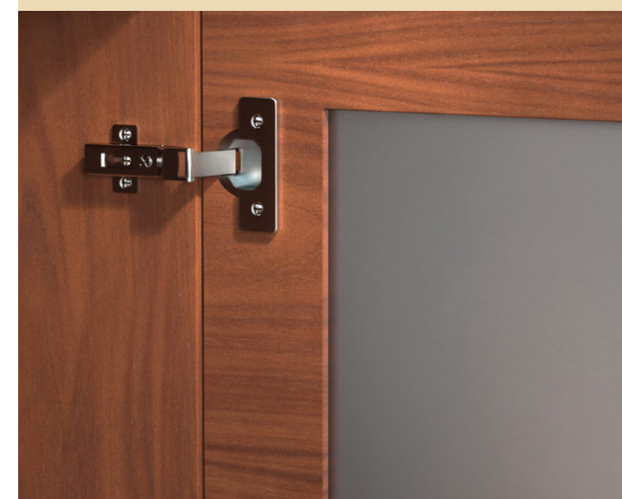
ALL OF BRIGHTON'S CABINET AND HUTCH DOORS FEATURE PRE-INSTALLED, SELF CLOSING EUROPEAN STYLE HINGES.