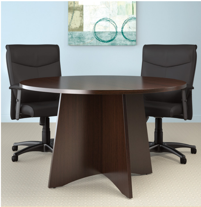
42" ROUND TABLES ARE ALSO AVAILABLE FOR SMALL CONFERENCE ROOMS OR PRIVATE OFFICES.