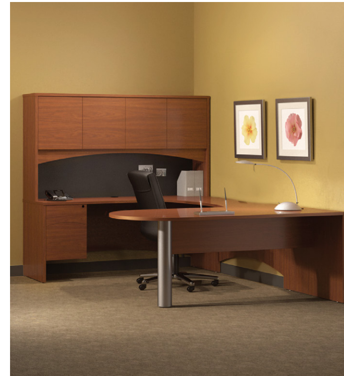
SINGLE-HEIGHT WOOD DOOR HUTCHES ARE OFFERED, AS WELL AS PENINSULA DESKS FOR EXTREMELY AFFORDABLE PRIVATE OFFICE CONFIGURATIONS.