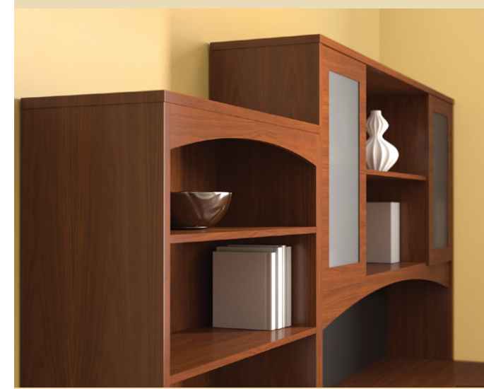
CURVED ACCENTS ARE FOUND THROUGHOUT THE BRIGHTON LINE ON SUCH ELEMENTS AS THE MODESTY PANELS, BRIDGE SURFACES, AND HUTCH AND BOOKCASE APRONS.