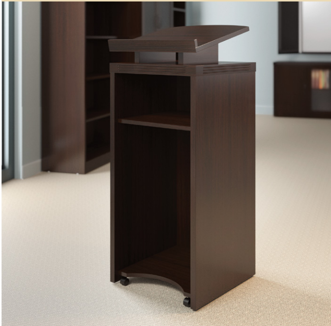
THE ABERDEEN MOBILE LECTERN FEATURES TWO CONCEALED STORAGE COMPARTMENTS WITH AN ANGLED DOCUMENT SHELF.