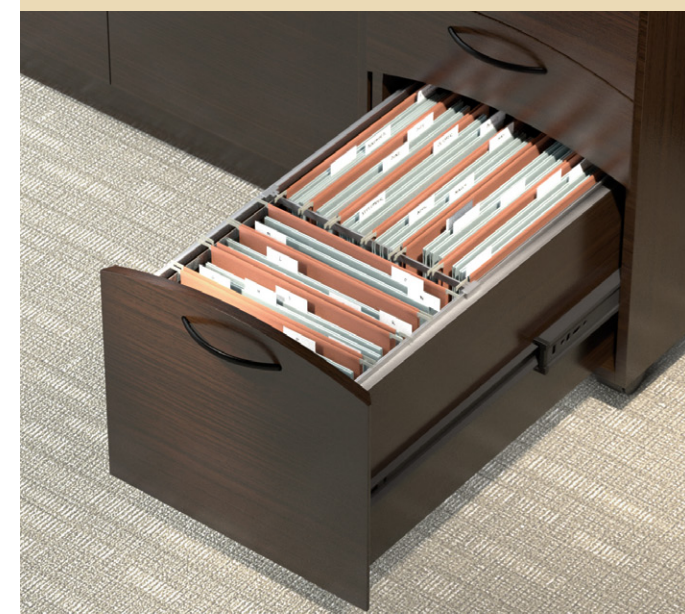
PEDESTALS ARE UNIVERSAL FOR RIGHT OR LEFT CONFIGURATIONS AND DRAWER FRONTS ARE PREDRILLED FOR OPTIONAL HANDLES, AS SHOWN.