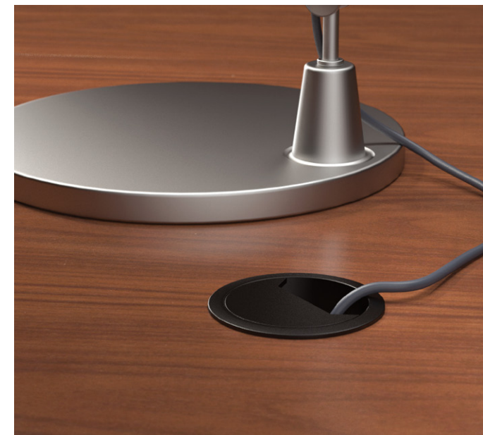
EXTENSIVE CORD MANAGEMENT IS FOUND THROUGHOUT THE BRIGHTON SERIES, A FEATURE NOT FOUND ON MANY COMPARABLY PRICED LINES.