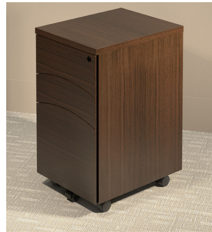
MOBILE PEDESTALS WITH CONCEALED PULLS ARE AVAILABLE FOR FULL HEIGHT APPLICATIONS. THEY SLIDE EASILY UNDER DESK SURFACES OR STAND ALONE.